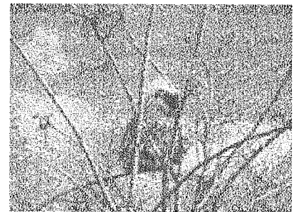
U.S. Fish and Wildlife

The common porcupine is an herbivore. It eats leaves, twigs and green plants like skunk cabbage and clover. In the winter, it may eat bark. It often climbs trees to find food. It is mostly nocturnal, but will sometimes forage for food in the day.