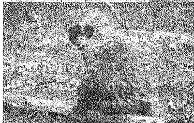
Harry Engels, National Park Service

The porcupine uses its quills for defense. The porcupine cannot shoot its quills. When a predator approaches, the porcupine will turn its back, raise the quills and lash out at the threat with its tail. If the porcupine hits an animal with its quills, the quills become embedded in the animal. Body heat makes the barbs expand and they become even more deeply embedded in the animal's skin. If an animal is hit in a vital place it may die. The porcupine is not an aggressive animal. It will only attack if it is threatened.